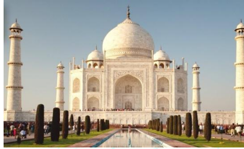
Taj mahal, Agra