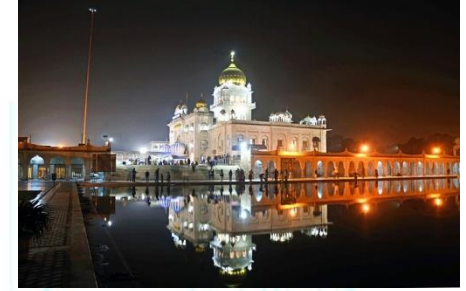
Gurudwara Bangla Sahib