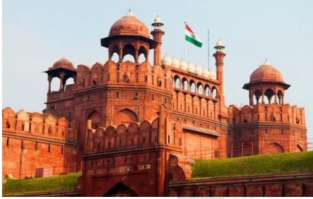
The Red Fort