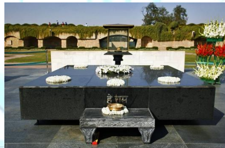
Mahatma Gandhi Memorial